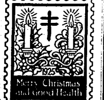
Christmas and Good Health

Progress Grandfather had a fern, father had a garden and son has a can-can-er.