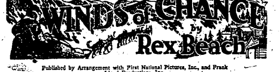
Published by Arrangement with First National Pictures, Inc. and Frank Lloyd Productions, Inc.

Subscriptions Rates: Daily, one year $6.00 Daily, six months 3.25 Daily, one month .60