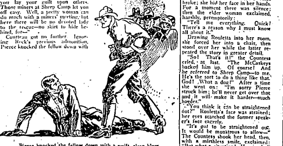
Pierce knocked the fellow down with a swift, clean blow.

"McCaskey's place is where the whole thing is plain enough to me."