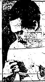
Miss Helen Wills