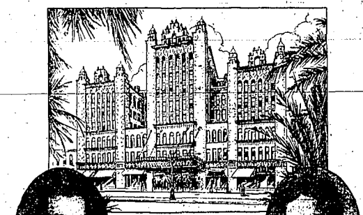
Temple Baptist Church, Los Angeles