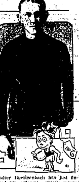
WATER INTERZSCHBACH, who captured the sensational Pan Am Normal basketball team this season.