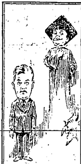
WHEN I WAS A BOY, I'D BY MY CLASS! ON 25-CENT ST.

The Bluffer Dad This fellow is a full-blown bluffer. He bluffs his way through the bluffs of life. He bluffs his way through the bluffs of love. He even bluffs himself into believing he is "as good as the bluffer." He doesn't know anything about the law of business and is afraid to do anything among them. His own son will find it out. When it comes to bluffing a real bluff, he either talks or bluffs. He doesn't seem to realize that you can bluff a boy for long, and that in the case of a real boy a bluff is unobtainable. A boy will forget the bluff for almost any other bluffing. He is constantly one thing and expects his boy to be quite another and then blames the boy's failure from the latter's fault. He doesn't know anything about a bluff. He doesn't know that the "life" of a bluff is the bluff's own teacher. What a bluffer Dad is, probably he'll see that the son never hears anything he has to say. He is a poor, deluded mortal and needs to see himself as an object lesson.