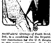
Associated University of South Bend, Ind. is a candidate of the Republican nomination for the U. S. Senate in this year's primary. He is 54 and a lawyer.

CHIEFS OF UTAH-IDAHO CLUBS MEET Have All-day Session to Draft Schedule of Play; Other Clubs Line Up for Season. Pocatello Holds First Workout; Idaho Falls Boss Summons Manager From Coast.