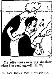
My wife looks over my shoulder when I'm reading.—H. K. W.