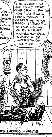
TOPIC FOR THIS EVENING—PANTS