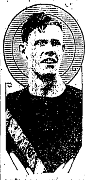
Portrait of a man in a suit, likely related to the 'Sprint Star' section.