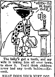
WHAT DOES YOUR WIFE DO?