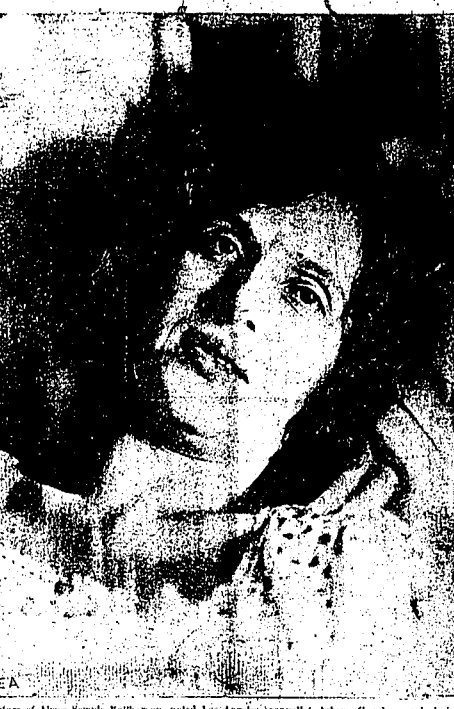
First picture of Alvin Semple McPherson, noted Los Angeles evangelist, taken after her arrival in Douglas, Arizona. Mrs. McPherson, who says she occupied after being captived by kidnappers, was too weak to sit up and pose for the photographer. She is shown here in her bed in the Douglas hospital.