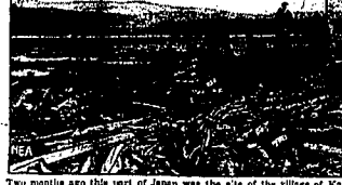
The volcanic site of the site of the village of Kamini, which was destroyed by a volcanic eruption and a flood—this is all that is left.