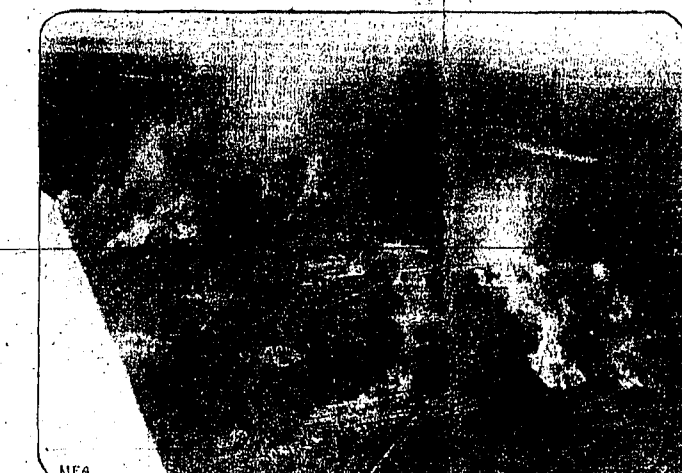
The view across the city from the air of the explosion at the arsenal, showing the smoke rising from the ground and the damage to the buildings.