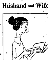
My wife is opposed to paint and powder and lets her hair shine.

WANTED TO TRADE - Lots in fine California town. WANTED TO TRADE - Lots in fine California town.