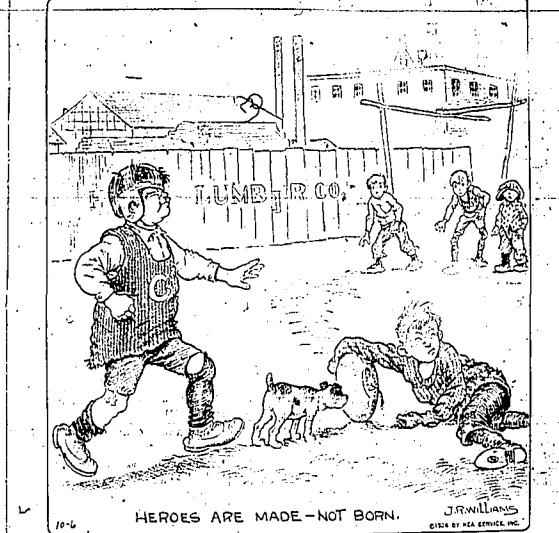
HEROES ARE MADE—NOT BORN.

Tree-Trunk Water Pipes During excavations near Hoboken, England, old wooden water pipes have been dug up.