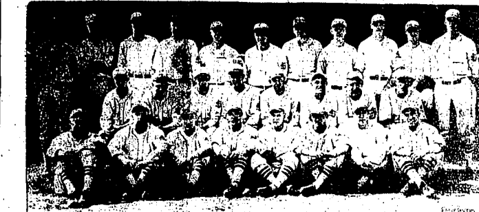
Mr. Rogers Hornsby's St. Louis Cardinals. From left to right: front row: Chick Hafey, Ernie Vick, 'Mac' Hahn, Bill Southworth, Bob O'Farrell...