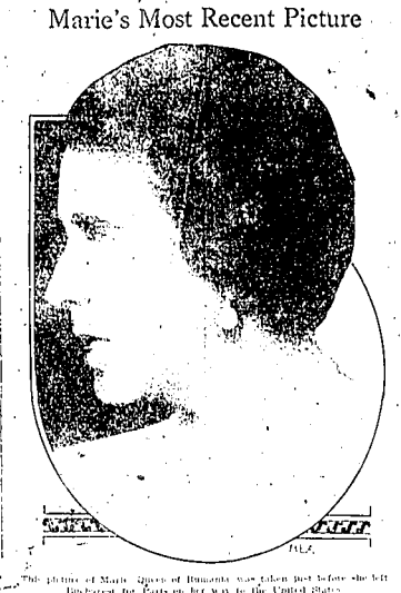
The picture of Marie Queen of Romania was taken just before the last outbreak of the Paris on her way to the United States.

One's eye does not depend on such upon the distance from the grade as upon the way that distance has been traveled.