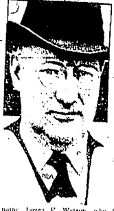
Senator James E. Watson, who is one of the leading figures in the state here now going on.