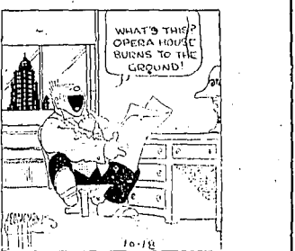
BRINGING UP FATHER