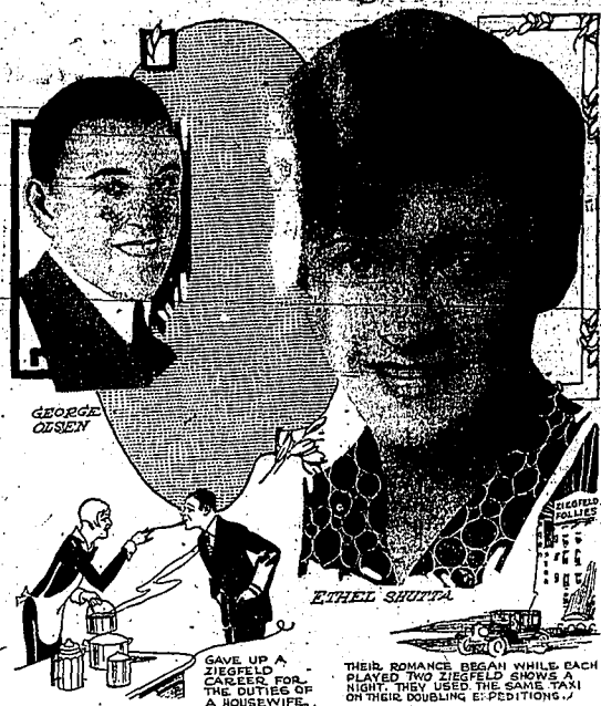
GEORGE OLSEN ETHEL SHUTTA GAVE UP A ZIEGFELD PART FOR THE DUTIES OF A HOUSEWIFE. THEIR ROMANCE BEGAN WHILE EACH PLAYED TWO ZIEGFELD SHOWS AT THE SAME TIME.

Where'd you get these eyes? Where'd you get those lips? Where'd you get those dimples, honey? Conductor and Comedienne, Playing in Two Ziegfeld Shows Marry. New York City.—A romance that grew out of a double doubling in the Ziegfeld Follies ended in one of Broadway's happiest marriages. The principals in this romance are Ethel Shutta, described by critics as the finest funniest comedienne, and George Olsen, famous orchestra leader and night club owner. The two met when both were playing in the Ziegfeld Follies. Each was also doubling in another Ziegfeld show, in this case, in Louis XIV. Olsen is Ethel's favorite comedian, and George and Ethel have been together since they met in the Ziegfeld show.