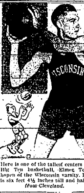
Here is one of the tallest centers in the Big Ten basketball, Elmer Tompkins of the Wisconsin varsity.