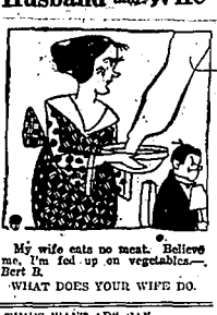
My wife eats no meat. Believe me, I'm fool up on vegetables. Bert B.

WHAT DOES YOUR WIFE DO. TIMES WANT ADS PAY.