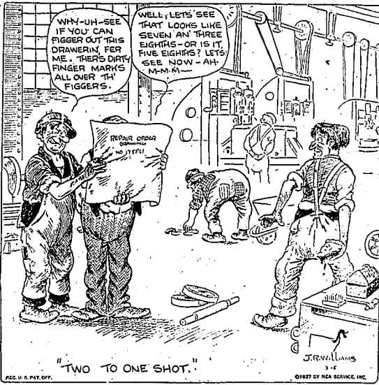
REG. U. S. PAT. OFF.

Rules for Pruning Trees The bureau of plant industry says that pruning an evergreen tree is not recommended, as pruning is liable to spoil the shape of the plant. In choosing plants for any particular position they should be selected with the height of the ultimate height, so that they will not need pruning. If they must be pruned, do it any time except in the spring, when the tree is making new growth.