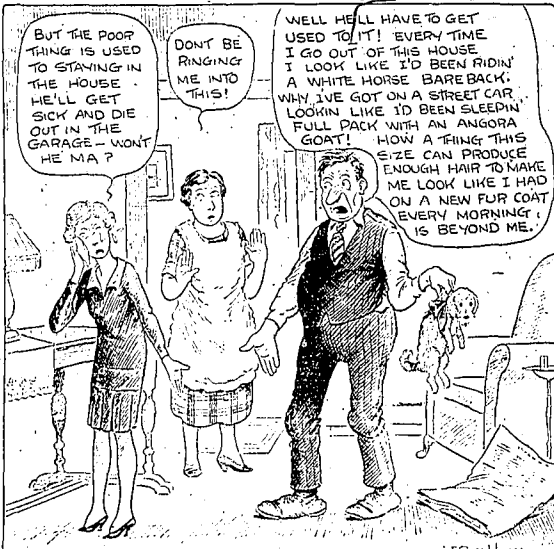
WHY MOTHERS GET GRAY HAIR IN THE CHAIRS.