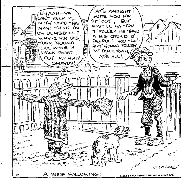
A WIDE FOLLOWING. ©1927 BY M&A SERVICE, INC. U.S. PAT. OFF.