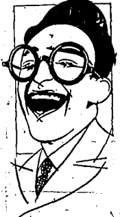
Harold Lloyd in 'The Kid Brother'

"PALM FIRST" STIRRING COMEDY-DRAMA Five big vaudeville acts and feature picture tonight.