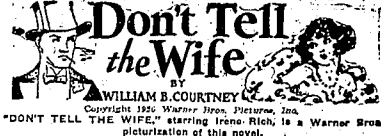
"DON'T TELL THE WIFE," starring Irene Rich, is a Warner Bros. production of this novel.

Entered at the Twin Falls Postoffice as Second Class Matter as a Daily Publication, April 11, 1918.