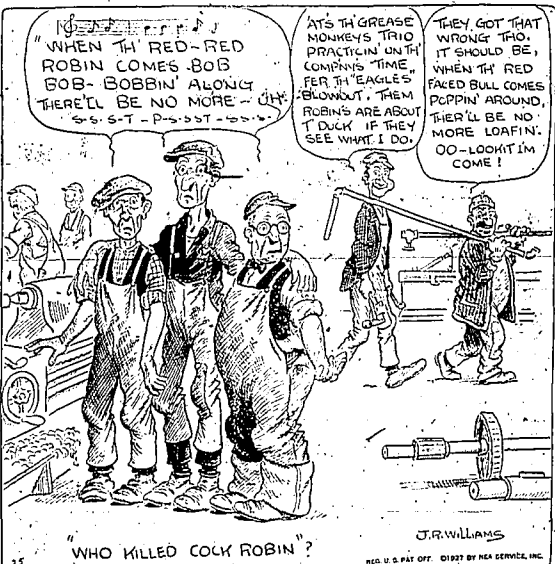
WHO KILLED COCK ROBIN?