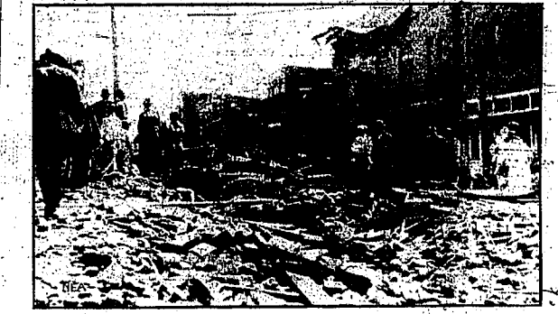
This shows the main street of Poplar Bluff, Mo., where a tornado last week wrecked buildings, killed 103 people and injured 200 others.