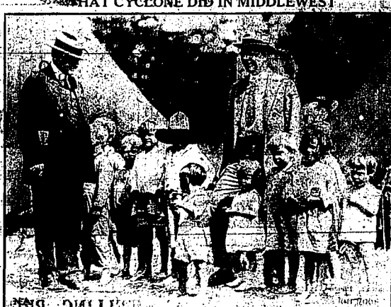
Here are the first pictures to be received from the zone devastated by the tornadoes that swept Kansas, Arkansas, Texas and parts of adjacent states, last last week. At least 200 people are dead, many more are injured and property loss has been extensive. These pictures show scenes in Hutchinson, Kan. Above is the wreckage of the Carver Salt Works, largest plant of its kind in the country. Below is a ruined residence.