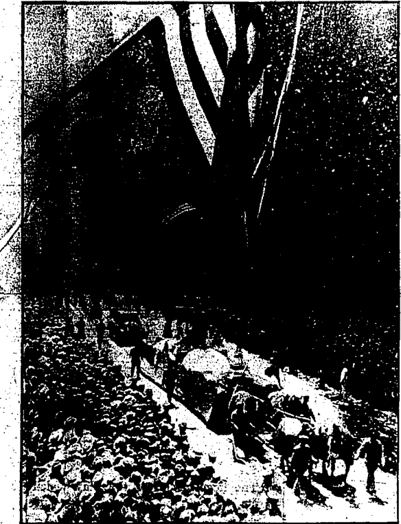
The most impassioned welcome New York ever gave any man—that's the way—the metropolis' welcome Sunday to Charlie Lindbergh was described by those who saw it.