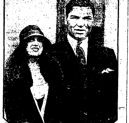
Jack Dempsey's return to the ring has awakened the sporting world to speculation as to whether or not the old king of the heavyweight can 'come back'.