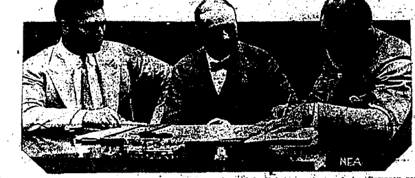
The next step will be some action of the... The winner will meet Gene Tunney for his title.