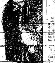
Secretary of State Kellogg has indicated that the United States will not enter a building race with England.

By United Press. WASHINGTON, July 7.—The United States will not enter a building race with England, Secretary of State Kellogg has indicated.