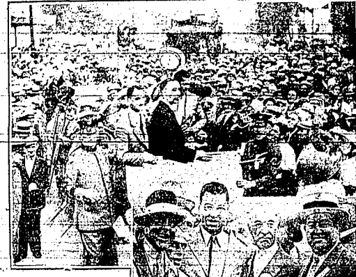
This shows something of the vast crowd of 10,000 which surrounded Jack Dempsey last week on his triumphant return to his Lakeland home after his victory over Sharkey.