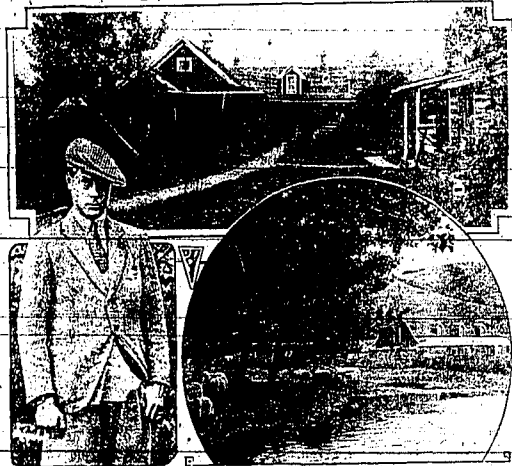
The Prince of Wales will turn "rough boss" again soon. He will take personal charge for a short time of his 400-acre "R-P Ranch" at High River, Alberta, in the Canadian Rockies. Here are shown the Prince's dog chubb, and the prince himself attired for "roughing it."