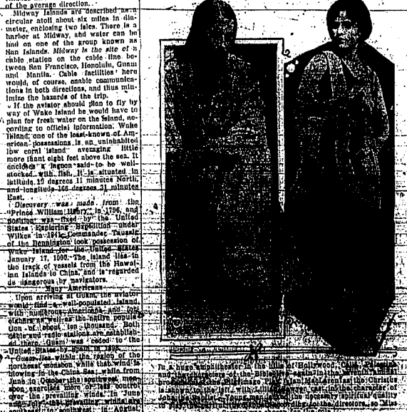
Pictured above is a two-piece "costly" dress in blue-cotton crepe. It is cut so as to give a well-defined silhouette in front.