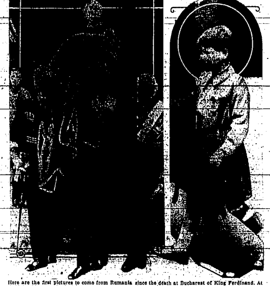
Here are the first pictures to come from Ramanala since the death at Bucharest of King Ferdinand. At the left side are shown carrying the casket holding Ferdinand's body to Cotroceni Castle, where it is being kept. At the right, the king's body is shown being led into the Chamber of Deputies, where he entered upon his kingship by hearing the regent take the oath of allegiance to him.