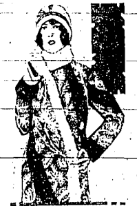
Any and all slays "embroidered" than they're "fashioned" in fashion, and they're "different." Choice is given between hand-laid all-over embroidered motifs, or zephyr-patterned knitted ones of hand-made tapestry weaves, preferably home-made. The furs which trim them are novel, too.