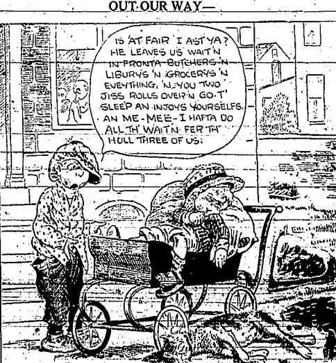
THE SILENT PARTNERS.

WANTED—ROOM AND BOARD. WANTED—COWS OR HEIFERS TO pasture. Phone 2513.