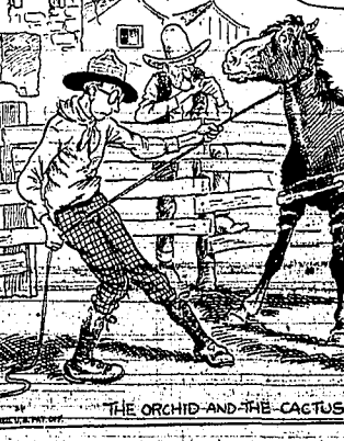
THE ORCHID AND THE CACTUS