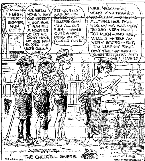
THE CHEERFUL GIVERS.