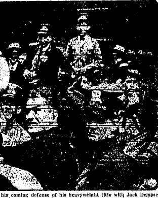
Gene Tunney, in Chicago, ready for his coming defense of his heavyweight title with Jack Dempsey, was greeted by thousands of cheering admirers upon arrival. The reception committee were in Chicago last night was quite different from ones accorded him on previous visits.