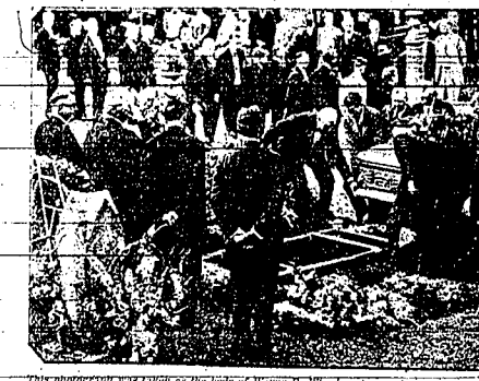
This photograph was taken as the body of Wayne B. Wheeler, deceased general counsel of the Anti-Saloon League and associate from all parts of the country.