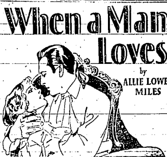
Princess of Wales in 'WILLEN A MAN GOVERN' is Warner Bros. Picture.

Yielded Averages (Arlington Globe) The best yielding average this season is 50 bushels to the acre.