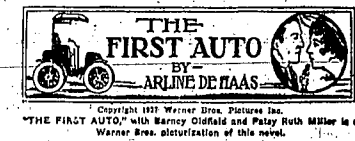
"THE FIRST AUTO" with Barney Oldfield and Patry Ruth Miller in a Warner Bros. production of this novel.

Government Over Ideas. Acquire a government over your ideas that they may come when they are called and depart when they are bid.