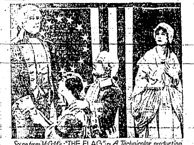
Scene from M-G-M's 'THE FLAG'—A Technicolor production.

School Superintendent and the teachers of Twin Falls, Idaho, are invited to a private screening of the new picture, "The Flag," which will run for 25 minutes over the radio on the afternoon of Nov. 12. The picture is a Technicolor production and is being shown in the Twin Falls School building.