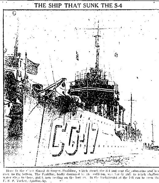
Here is the Great Guard steamer, paddling, which struck the S-4 and sent the submarine and her crew to the bottom. The paddling, badly damaged by the collision, was last sighted to track shallow water close to base, and is now resting on the bottom. In the background at the left can be seen the U. S. S. Tucker, standing by.