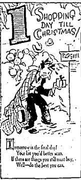
Remember in the final day! You'll find better can. If because you're still in the market, Well—do the best you can.