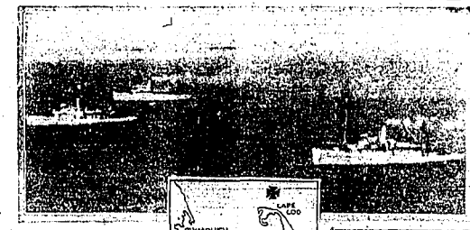
The NEA Service, Inc. telephoto of the Twin Falls shows a picture from the air of the site of the disaster in the U. S. 84, showing the location of the destroyer standing by in the rescue attempt. Below is a chart showing the location of the submarine.