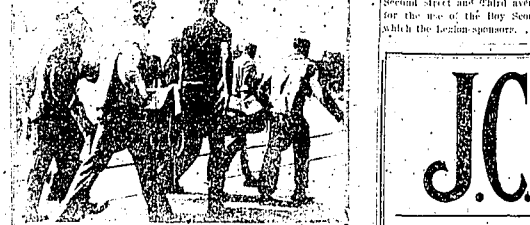
This picture, posted by phone and telegraph to The Times, is the first to show victims of the fatal explosion on the aircraft tender Laney at San Diego.