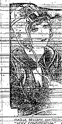
MADGE BELLAMY and MICHAEL CUNNING

VERY CONFIDENTIAL WILLIAM FOX ATTRACTIONS