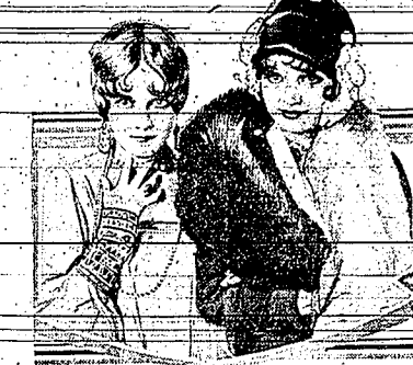
MILTON SILLS AND ALICE WHITE IN 'VALLEY OF GIANTS' PRODUCTION 'GENTLEMAN FROM PARIS' AT PARAMOUNT THEATRE

Milton Sills has made his first Idaho appearance at the Idaho Theatre. The production of Peter B. Kyne's romantic story of the "Valley of Giants" is being presented at the Idaho Theatre. The production is a very successful one and the evening was a very enjoyable one.