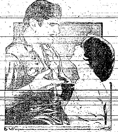
DOUGLAS FAIRBANKS as THE GAUCHO