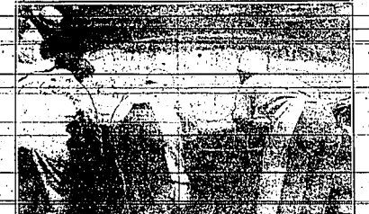
World's Largest Prune Pie. This pie, measuring 23 feet in circumference, was baked in Los Angeles. It measured 4 feet in diameter, 12 inches deep and contained 200 pounds of flour and 15,000 prunes.