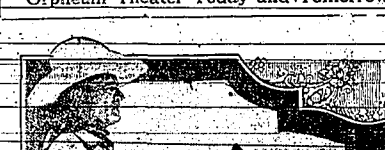
The great American desert in all its glory... REGINALD DENNY