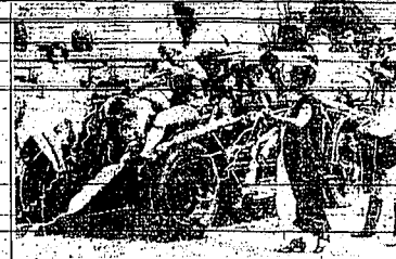
Students at Brenau College, Gainesville, Ga., turned out in force for their annual airfare contest. Examining the paper were automobiles like that pictured all decked out with feminine and other adornments.

By United Press PARIS - France's first effort at prohibition has begun as an experi- ment in Paris in the army. The General commanding infantry troops at Fontainebleau studied his men and their morale and found that wine, especially white wine, had a deleterious effect on the young soldiers. He issued an order to his troops to leave all alcoholic drinks alone, and warned each keeper of heavy fines for disobeying his order for- bidding the selling of liquor or wine to troops. The rest of the army is watching the experiment with interest. - For Commercial. Editing call 38.