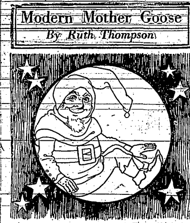
Color this picture and see how near it looks like the "Man in the Moon."

Who's Norwiche? the Man in the Moon screamed at us. . . . "But when you are around, my dear, you are in the moon said with a bow. . . . "Tut! Tut!" cried Mother Goose. . . . "But when you are around, my dear, you are in the moon said with a bow. . . . "Tut! Tut!" cried Mother Goose.