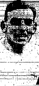
Harold Abraham, former star Olympic, who captained the British sprint track team.