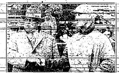
Wilbert Robinson (left), veteran manager of the Brookline Dodgers, wishes Bert Shotton good luck in his first season as pilot of the Philadelphia Nationals. Bert's flyers returned the compliment by returning Robinson's.