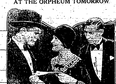
Scene from THANKS FOR THE BUGGY RIDE with LAURA LA PLANTE and GLENN RAYON. A UNIVERSAL PICTURE.