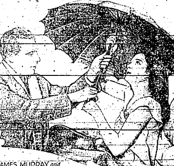
JAMES MURRAY and ELEANOR BOARDMAN in "THE CROWD" The Metro-Goldwyn Big Special which opened a three-day run at the Idaho Theatre today.